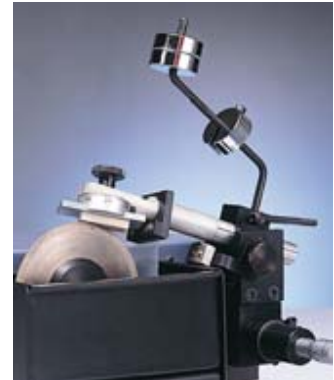
360° swivelling chuck

Width: 270mm Depth: 300mm Height: 280mm Weight: 8.5 Kg