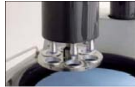
TCI 15 head