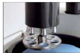
TI 15 head

The Kematech P300 Automatic Polishing machine is a 6 station pressure polishing machine with variable speed and pressure controls. It is suitable for 250mm or 300mm Diameter plates.